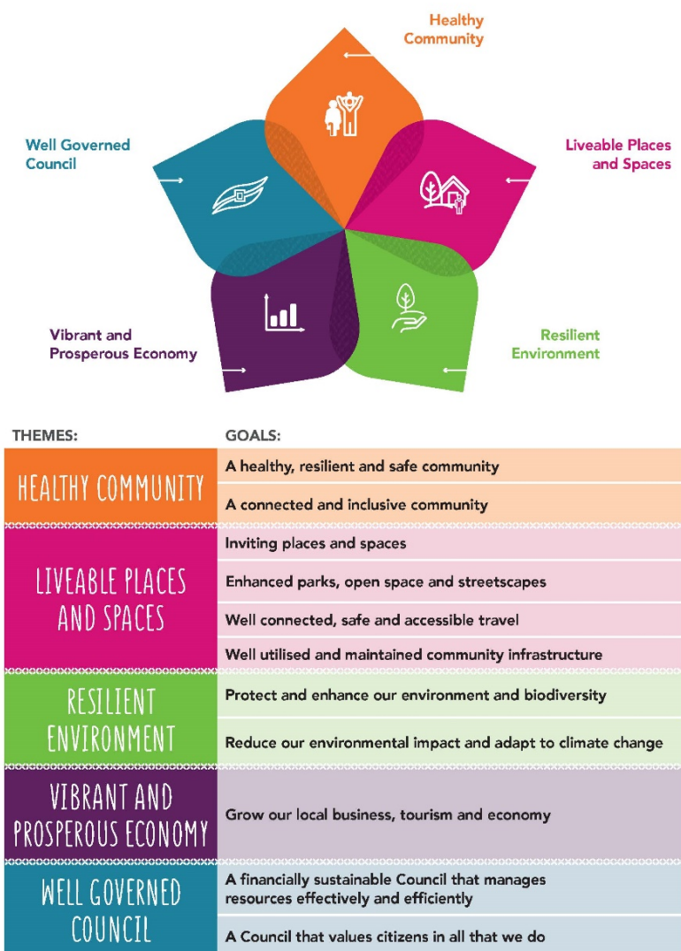
FIGURE 1: Council Plan Themes and Goals

The timeline of the Dementia-Friendly City action plan extends beyond that of Council’s current Plan and Healthy City Strategy. The policy context is important to note because the development of this document was guided, in part, by the Plans currently in place. It is an aim of this project, and incorporated into the project’s action plan, to play a role in informing the development of Council’s future Plans and Strategies so that becoming a Dementia-friendly city remains one of Council’s priorities.