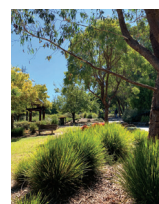
COVER IMAGE: A sunny afternoon at Ruffey Lake Park in Doncaster.