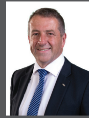
Cr Andrew Conlon (Mayor)