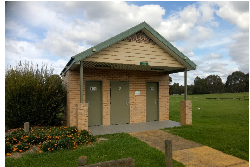
B. Standalone facility with unisex self-contained toilets – manually maintained.