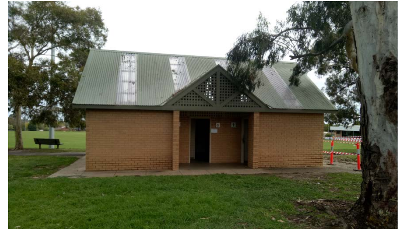
A. Older style standalone facility with gender segregated toilets.

Council also has an agreement with Beasley's Nursery that their facilities be available to the general public during opening hours.