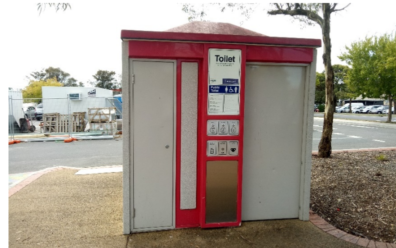
C. Standalone facility with unisex self-contained toilets – automated maintenance.

The National Public Toilet Map also lists a number of petrol stations that have been registered by their owners as public toilets.