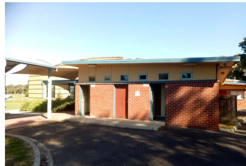
D. Independently accessed toilet facilities, under same roof as a pavilion or other building. Mix of unisex and gendered toilets.