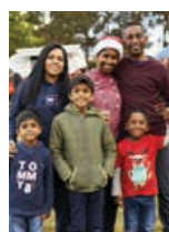
COVER IMAGE: Join in the fun at our annual Carols by Candlelight at Ruffey Lake Park.

Manningham Council also values the contribution made to Manningham over the years by people of diverse backgrounds and cultures.